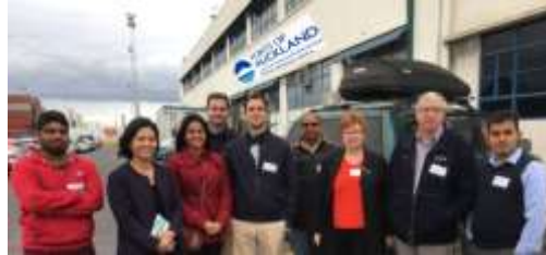
POAL Site Visit - Apr 2017 Batch