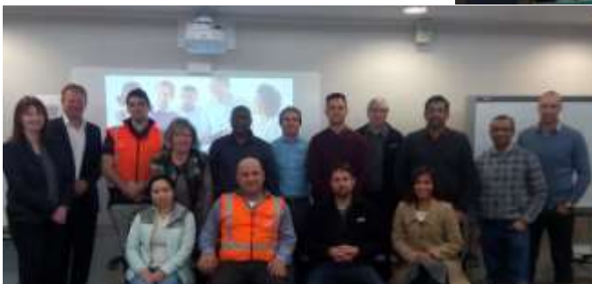
POAL Site Visit Mar 2017 ↑