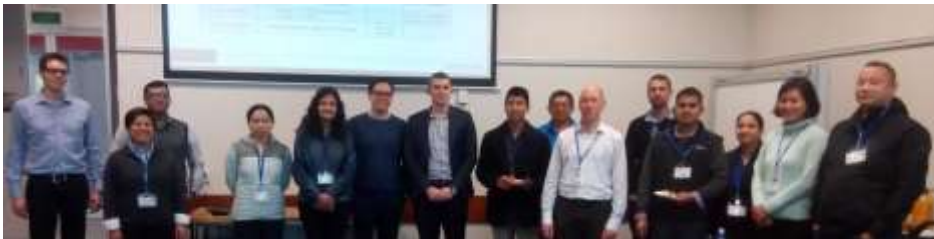
FPHC Site Visit – Aug 2017