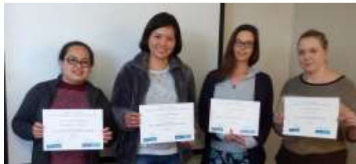
S&OP Workshop Aug Batch